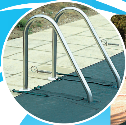
LADDER CUTOUT DETAIL