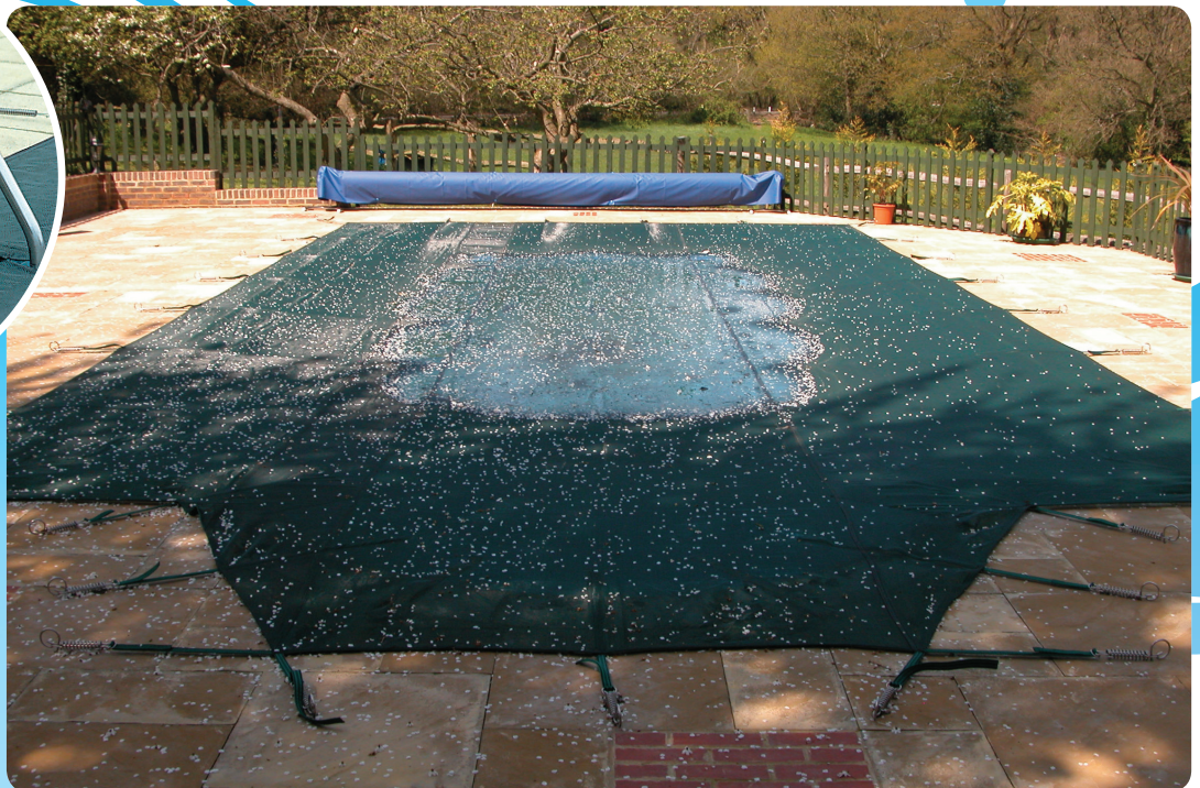
SHAPED ROMAN END