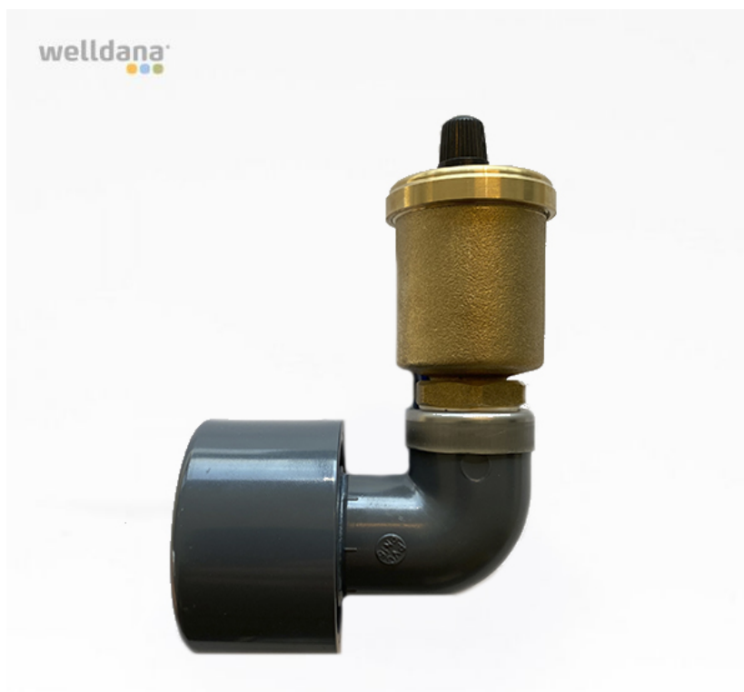
Airing valve for sunpanels.